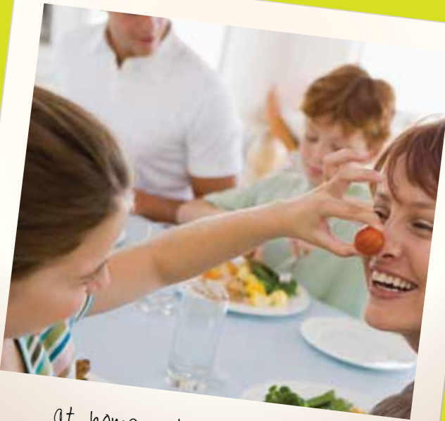
at home with my family...