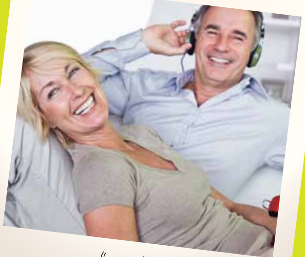
our "alone" time...