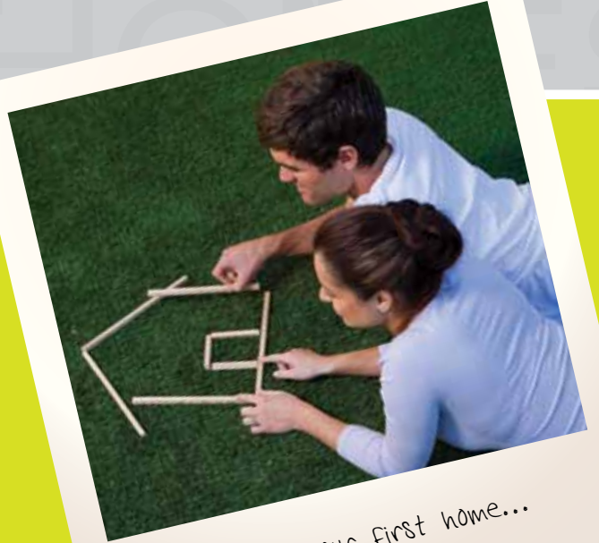
planning our first home...